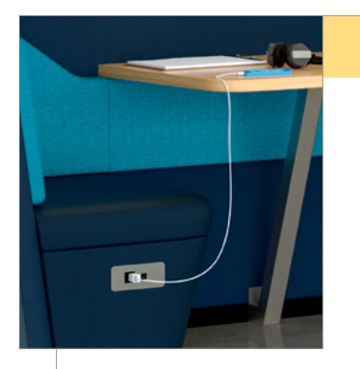
Convenient power options make it easy to plug-in and recharge.