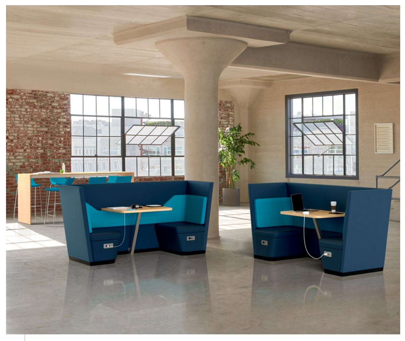
#6510-65TS-PB1 Public Lounge Models with Integrated Tables and Seat-Mounted Power Band 1 Units