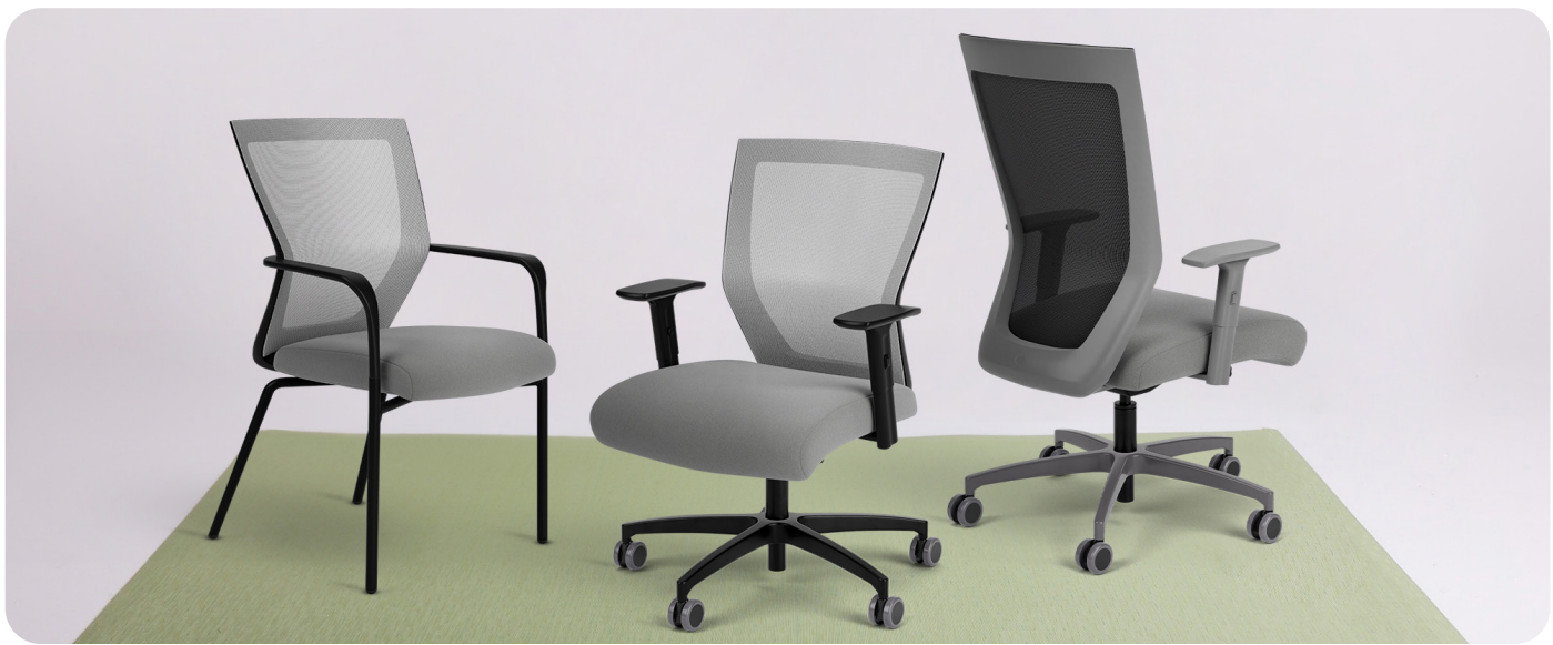
Guest chair #931